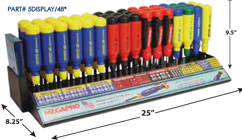
48 PIECE DISPLAY PART# 5DISPLAY/48*